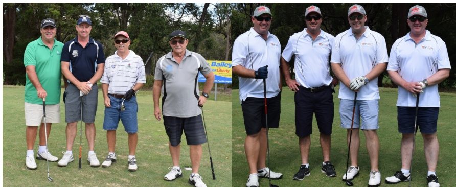
PHOTO BOOTH - GOLF DAY 2019