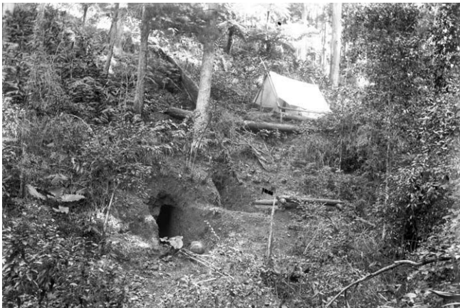
Mine entrance and miner's campsite at the Beacon Mine, Coffs Harbour Circa 1889