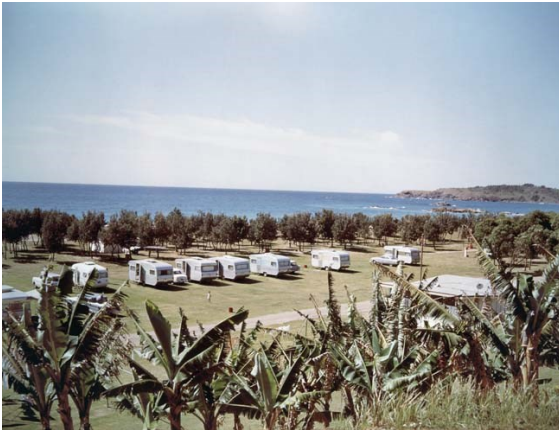
Coffs Harbour Caravan Park Circa 1967